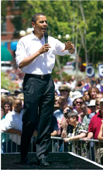
Even with his increased duties as U.S. president, Barack Obama is committed to making wellness and fitness part of his daily life.

The number and scope of each of these issues is overwhelming. We're already seeing the minds of the marketing gurus globally inserting opportunity where challenge was used. Tough decisions will become smart decisions. Doesn't every one want to think they made smart decisions to curtail frivolous personal spending? If we aren't directly involved with the solutions, we'll watch from the sidelines and debate at the office water